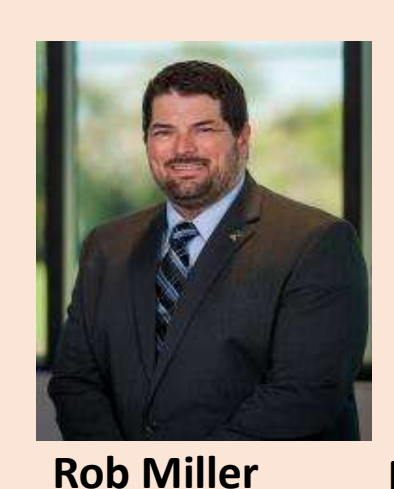
Vice President of Safety, Keeley Construction