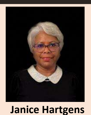
Vice President, Respond Ready Workplace, National Safety Council